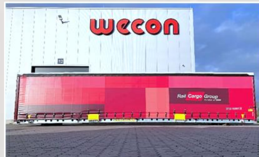
45ft swap bodies