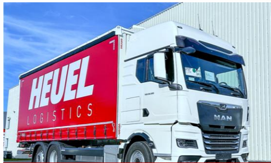
Rigid truck bodies